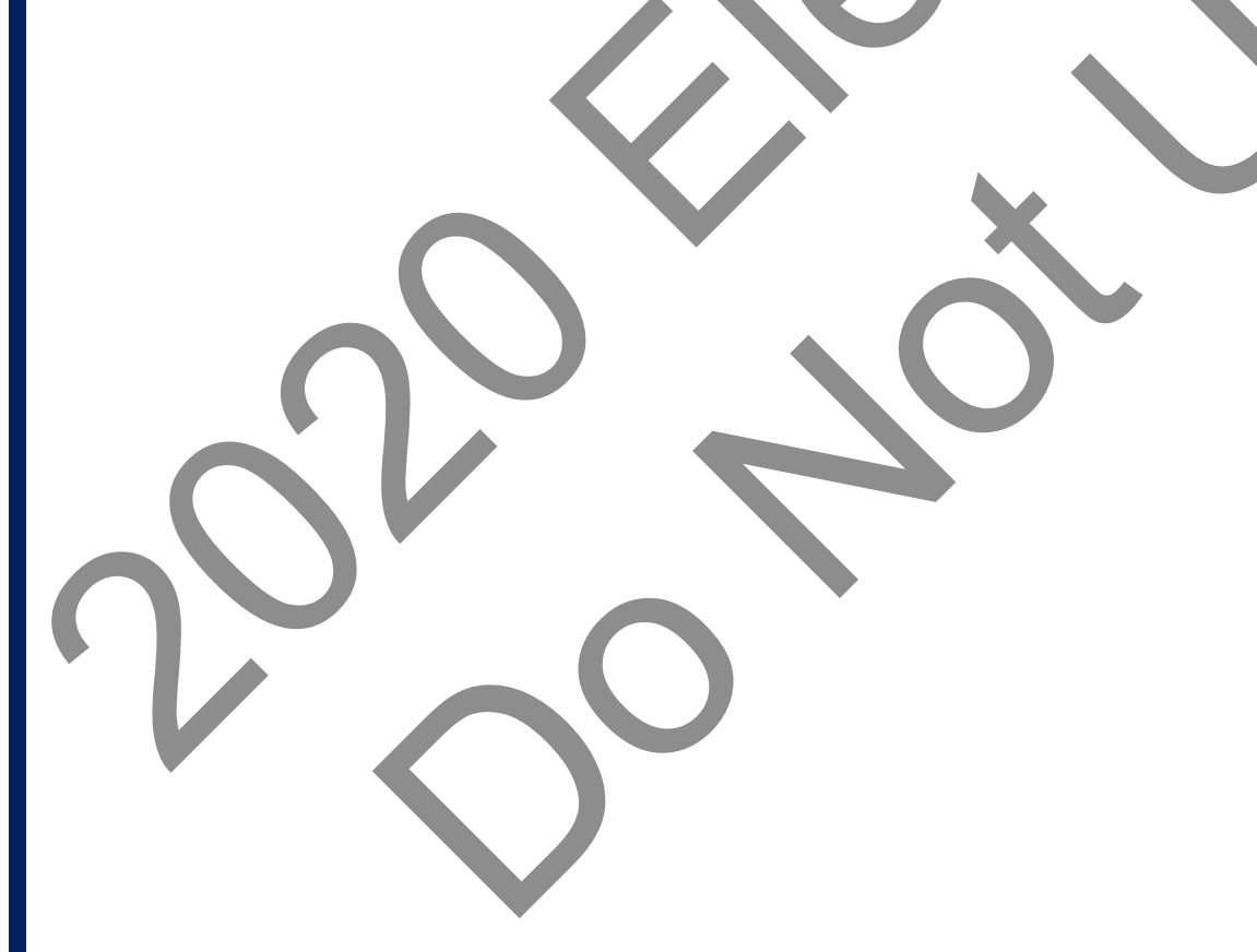
Key: * = Incumbent; DNP = Did not participate; NCI = No contact information available