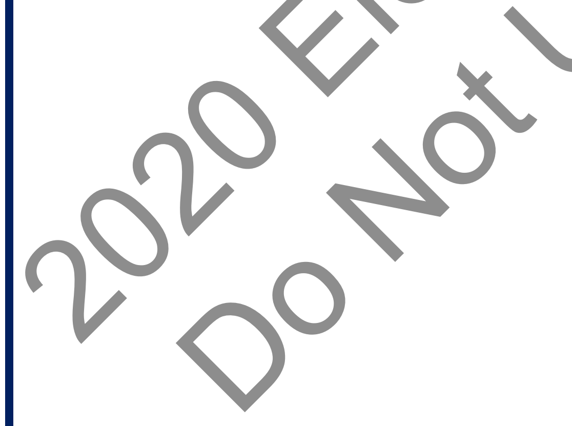
Key: * = Incumbent; DNP = Did not participate; NCI = No contact information available